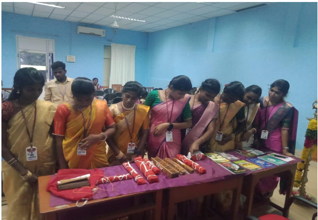
II B.A., Archaeology students Observing the manuscripts