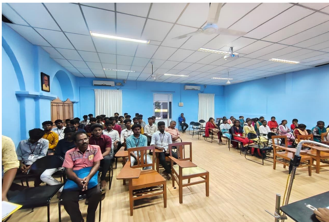
Department students and staff members