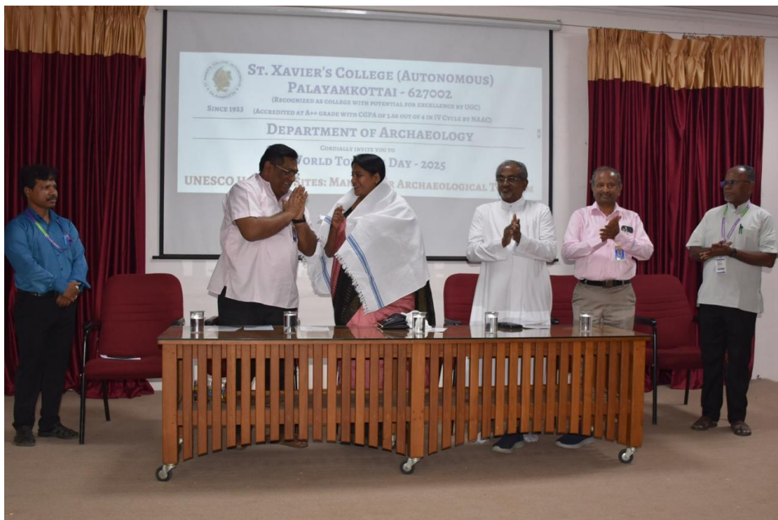
Rev Fr. Principal honour the chief Guest