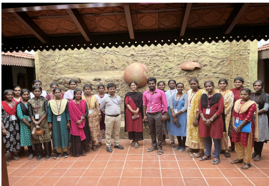
Professors and I B.A., and II B.A., Girls Students Keeladi Museum