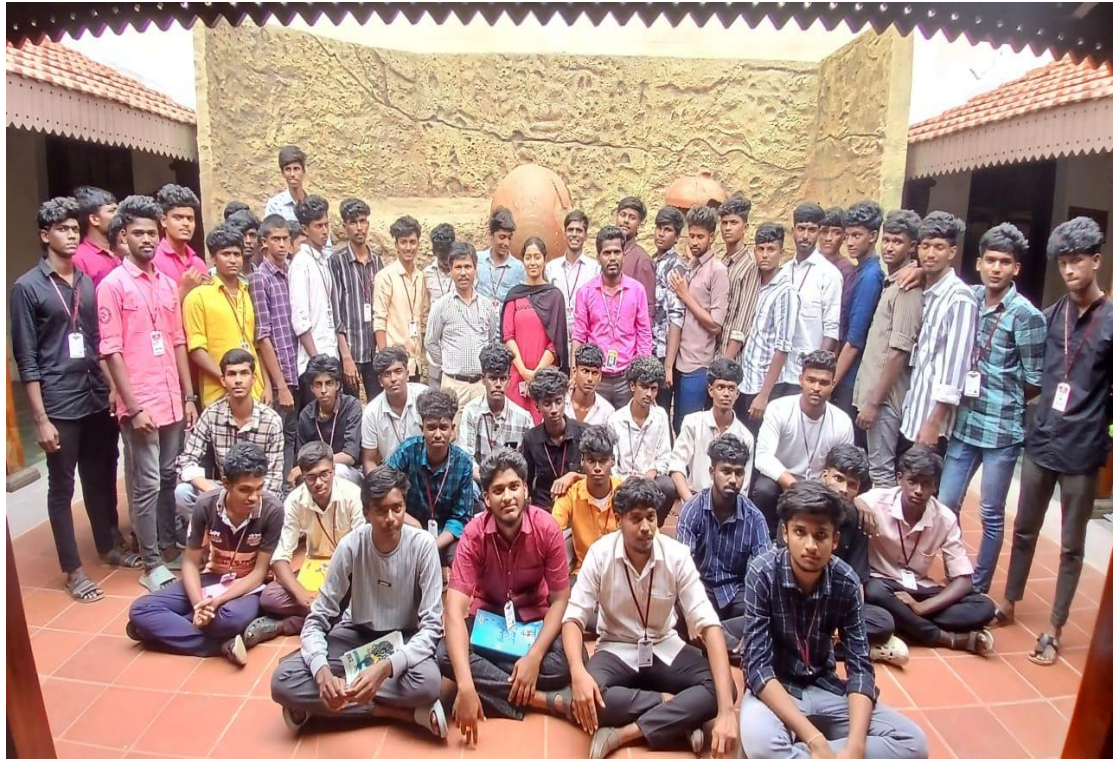
Professors and I B.A., and II B.A., Boys Students Keeladi Museum